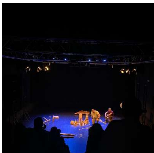
With an audience in the stands